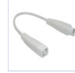
424020003 CONNECTION PLUG 150 RGL LEDECO