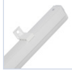
424020004 GR ACCESSORY RGL LEDECO