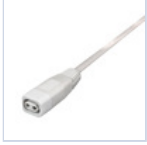
424020006 MAIN POWER L1500 REGLED ECO