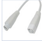
424020005 CONN PLUG 1.5MT RGL LEDECO