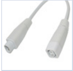
424020009 CONNECTION PLUG 2MT RGL LEDECO