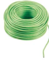
732I.E.100 - 2F+ LSZH cable 2x1 outer laying Eca 100m