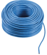
732H.E.100 - 2F+ PVC cable 2x1 intern.laying Eca 100m