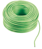
732I.E.500 - 2F+ LSZH cable 2x1 ext. laying Eca 500m