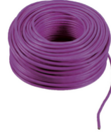
732I.C.100 - 2F+ cable 2x1 LSZH Cca 100m purple