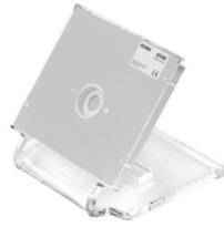
40596 - Tab 7 Up desktop