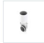
18592 KIT IP65 TUBO BOX BASSO P.MOD