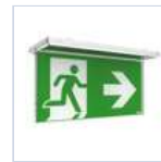
18581 SCHERMO BAND SX/DX P.MODULA