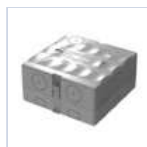
18589 STAFFA DERIVAZIONE EASY BOX