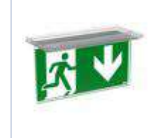
18582 SCHERMO BAND BASSO P.MODULA