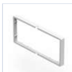
18598 CORNICE ESTETICA