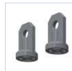
3723 GANCIO SOSPENSIONE 4004/PR