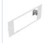
18586 STAFFA CONTROS+CORNICE