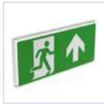
18596 SCHERMO ALTO P.MODULA