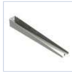
18585 STAFFA PARETE BAND P.MODULA