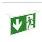
4128 SCHERMO BAND PRATICA BS