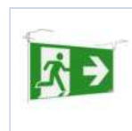
4127 SCHERMO BAND PRATICA SX/DX