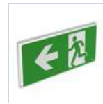
18593 SCHERMO SX P.MODULA