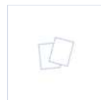
18584 ADES SX/DX/BS/UP P.MODULA