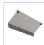
18590 STAFFA 45° P.MODULA