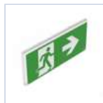
18594 SCHERMO DX P.MODULA