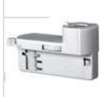
4319 KIT BINARIO TRIFASE UP LED