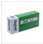
RA10 BOOSTER AR S LiFe 3.2V 0,5Ah