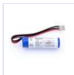
415437001 LI-FEPO4 3.2V 0.5AH 14500