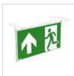
4129 SCHERMO BAND PRATICA UP