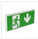
18595 SCHERMO BASSO P.MODULA