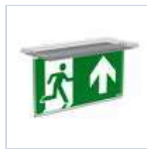
18583 SCHERMO BAND ALTO P.MODULA