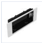
18580 SCAT INCASSO+CORNIC P.MODULA