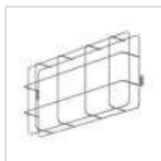
18591 GRIGLIA EM 305X135X80