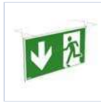
4128 SCHERMO BAND PRATICA BS