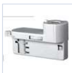
4319 KIT BINARIO TRIFASE UP LED