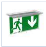
18582 SCHERMO BAND BASSO P.MODULA