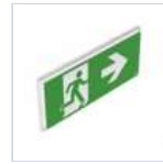
18594 SCHERMO DX P.MODULA