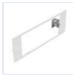
18586 STAFFA CONTROS+CORNICE