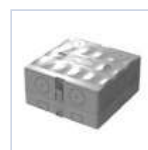
18589 STAFFA DERIVAZIONE EASY BOX