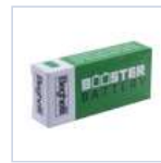
RA11 BOOSTER AR M LiFe 3.2V 1,5Ah