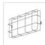
18591 GRIGLIA EM 305X135X80