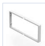
18598 CORNICE ESTETICA