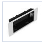
18580 SCAT INCASSO+CORNICE P.MODULA