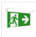
4127 SCHERMO BAND PRATICA SX/DX