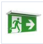
18581 SCHERMO BAND SX/DX P.MODULA