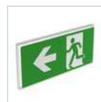
18593 SCHERMO SX P.MODULA