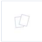
18587 STAFFA BLINDOLUCE P.MODULA