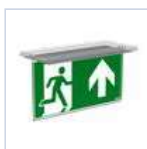
18583 SCHERMO BAND ALTO P.MODULA