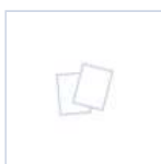
18584 ADES SX/DX/BS/UP P.MODULA