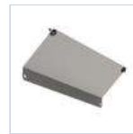
18590 STAFFA 45° P.MODULA