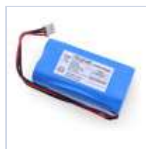
415441001 LI-FEPO4 3.2V 3AH 18650