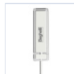
19375 MODULO LGFM INVERTER LED