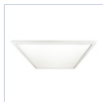
40112 L PAN M600 U19 C90 ED IP65 3K