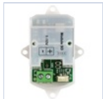
15034 MODULO 1-10V