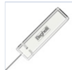
15022 MODULO RADIO DOMOTICO