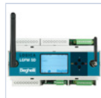
21102 CENTRALE DOMOTICA SD- LGFM