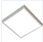
20097 CORNICE PLAF LED PANEL 600X600