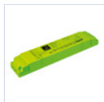
19359 INV P&L LED SE/SA 3H 20-60V