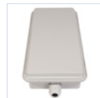
19376 GUSCIO IP65 INVERTER LED