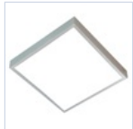
20100 CORNIC PLAF LED PANEL 300X1200