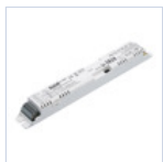
19391 INV EXT AT/LG AR 15W 55V LIFE