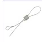
70059 KIT CAVETTO DI SICUREZZA