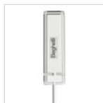
19375 MODULO LGFM INVERTER LED