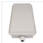
19376 GUSCIO IP65 INVERTER LED