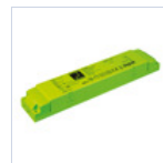
19359 INV P&L LED SE/SA 3H 20-60V