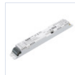
19355L INV LED AT/LG AR 9W 55V LIFE