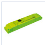
19358 INV P&L LED SE/SA 1H 20-60V