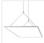
70100 SUSPENSION 4 HOOK PANELED