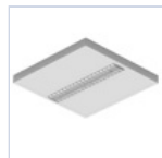
20101 CORNICE PLAF BACKLITE 300X1200