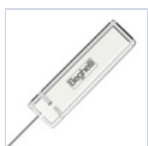
15022 MODULO RADIO DOMOTICO