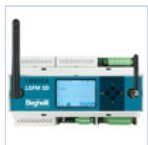
21102 CENTRALE DOMOTICA SD- LGFM