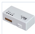
20104 TRASMETTITORE RADIO DOMOTICO