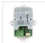
15024 MODULO DALI