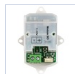
15034 MODULO 1-10V