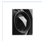
15039 FOTOSENSORE OPTICOM