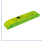
19358 INV P&L LED SE/SA 1H 20-60V