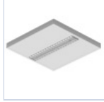
20089 CORNICE PLAF BACKLITE 600X600