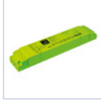
19359 INV P&L LED SE/SA 3H 20-60V