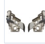
70049 CLIPS UNIVERSALE CGESSO M600