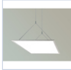
70033 SUSPENSION WIRE PANELED