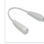
424020003 CONNECTION PLUG 150 RGL LEDECO