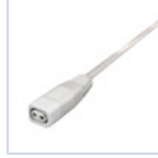
424020006 MAIN POWER L1500 REGLED ECO