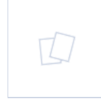
15079 MODULO LG SLIM