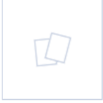
15080 MODULO DALI SLIM