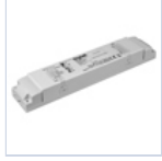
19398 INV UNIV AT RM 5W 20-240V