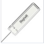
15037 MODULO LGFM