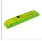
19367 INV P&L LED SE/SA 1H 60-180V