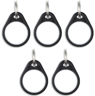
40175 - 5 MIFARE RFID keys