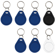
40169 - 7 Mifare RFID keys