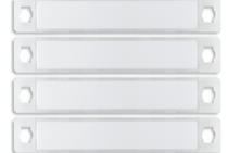
40174 - 4 buttons kit for entrance plate 40170