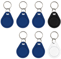
40169 - 7 Mifare RFID keys