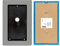
40179 - Semi-flush accessories for plate 40170