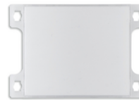
40171 - Button kit for entrance plate 40170