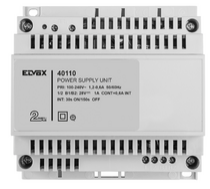
40110 - Supply unit 2F+ 100-240V 1 OUT 1,6A