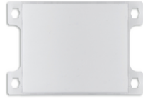
40171 - Button kit for entrance plate 40170