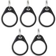
40175 - 5 MIFARE RFID keys