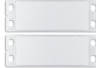
40172 - 2 buttons kit for entrance plate 40170