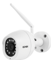
46237.040A - Bullet Wi-Fi cam - Full-HD 1080p 4mm