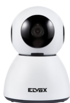
46239.040A - PT Wi-Fi Full- HD cam - 1080p 4mm