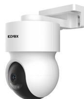
46241.030B - Outer Wi-Fi PT 1080p cam - 3mm