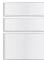
42920.K - 1-2-4 button kit for RFID Video kit plat