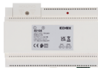
40105 - Power unit DIN 100- 240V~ 50/60Hz 32Vdc