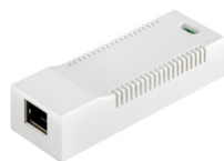
40168 - Converter IP/2-wire for cams