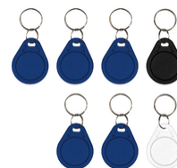
40169 - 7 Mifare RFID keys