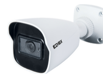
4621.2812BA - IP IR Bullet cam 2Mpx -2,8-12mm A.V.