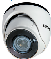
4622.2812BA - Dome IR IP 2Mpx cam - 2,8-12mm Mic A.V.