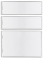
42920.K - 1-2-4 button kit for RFID Video kit plat