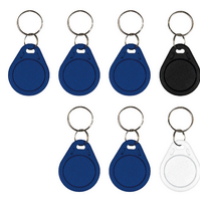
40169 - 7 Mifare RFID keys