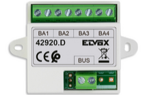
42920.D - Bus distributor 4 outs Video RFID kit