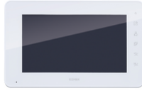
K42932 - Additional 7in monitor DIN power supply