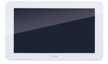
K42937 - Additional 7inTSmonitor DIN power supply