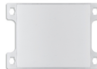
40171 - Button kit for entrance plate 40170