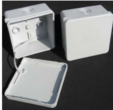
Dettaglio coperchio imperdibile Unlosable cover detail