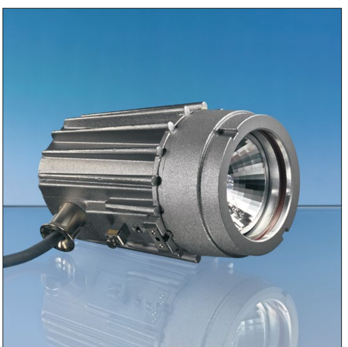
Lumistar luminaire USL 06