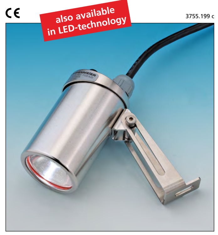
Lumistar luminaire USL 13 with hinged bracket mounting

50-watt luminaires should only be operated by push-button (not in continuous mode). Should an integrated push-button not