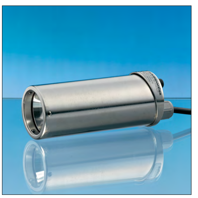
Lumistar luminaire USL 33

be included in the order/scope of supply, it is essential for an external momentary-contact push-button or a timer to be installed in the power supply line, outside the luminaire! Under no circumstances should the maximum temperatures specified for the luminaire be exceeded.