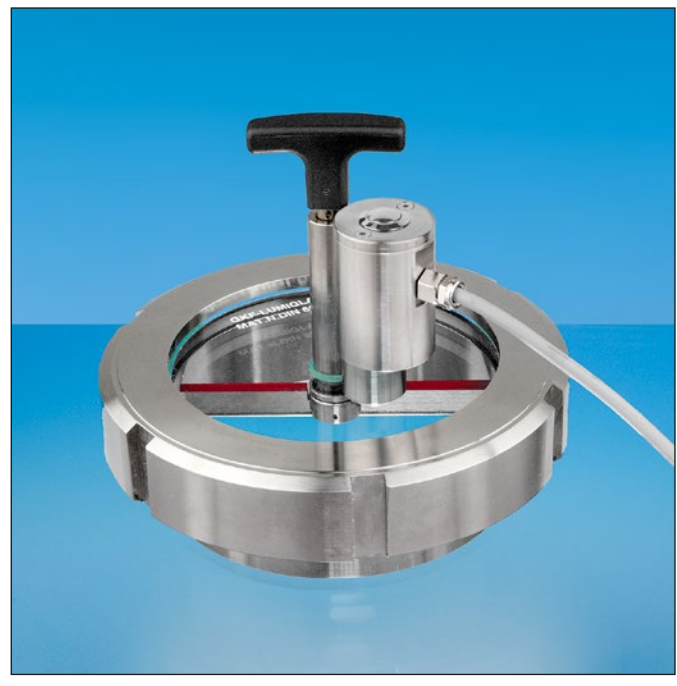
Lumistar luminaire ESL 51-LED-HK installed on a screwed sight glass fitting equipped with Lumiglas wiper unit SW I