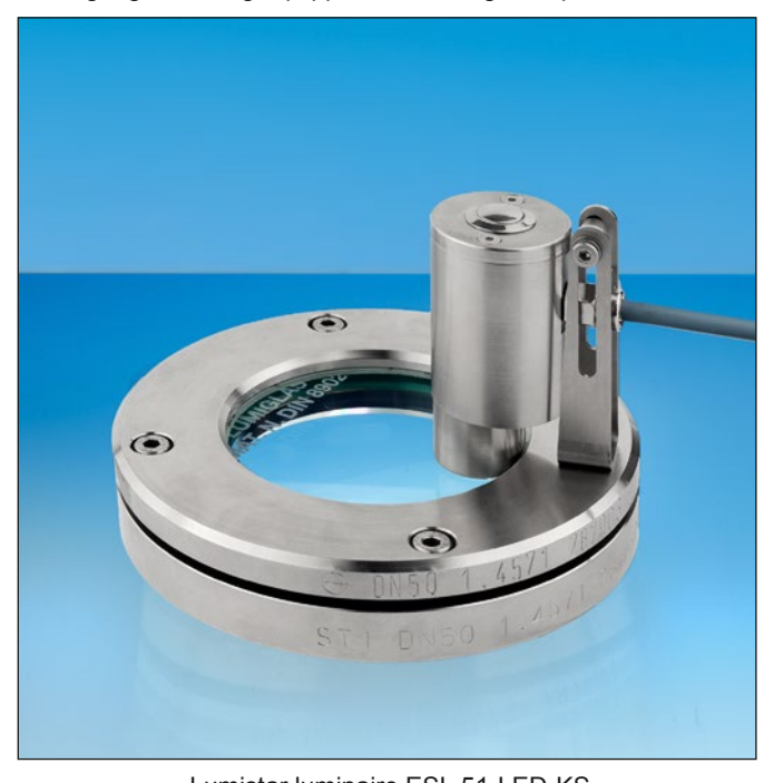
Lumistar luminaire ESL 51-LED-KS adapted to a standard flange