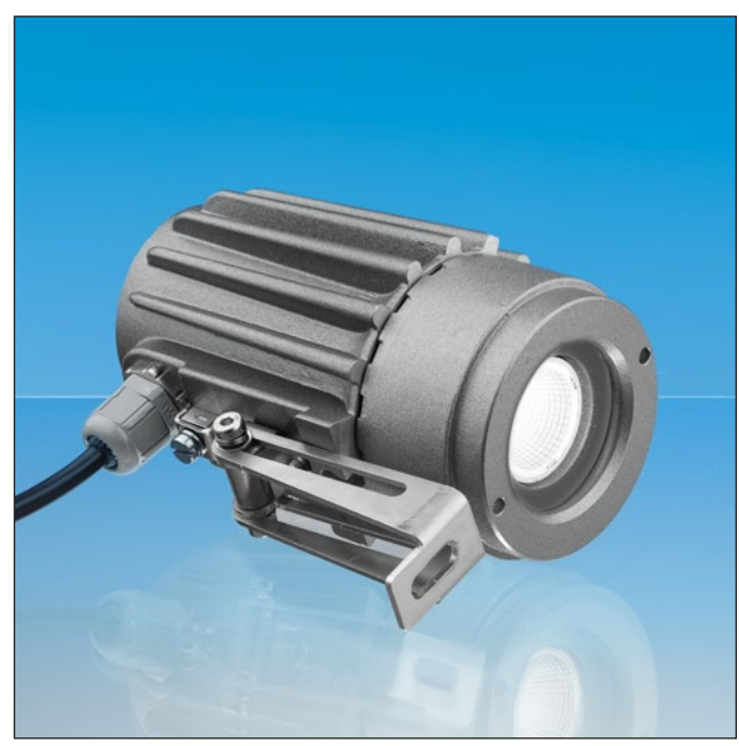
Lumistar luminaire USL 05-LED