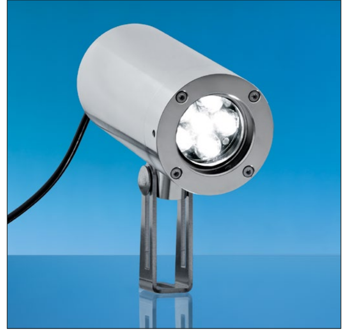
Lumistar luminaire ESL55LED-Ex