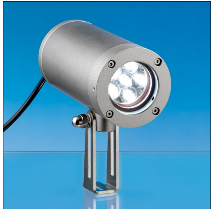
Lumistar luminaire ASL55LED-Ex