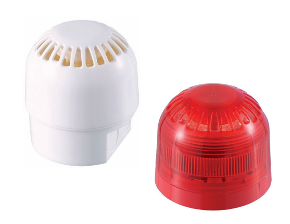
Applications - Fire; Industrial; General safety alarm