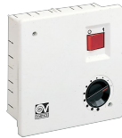
SCNRB SCAT.COM.NON REV.INCASSO Code 12971