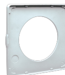
S 100/4 Code 22154