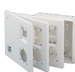
KIT SCB (TRASF.E.C.) Code 22481