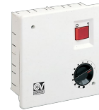
SCNRB SCAT.COM.NON REV.INCASSO Code 12971