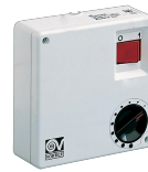
C 1.5 (COMANDO EL. 1.5 A) Code 12966