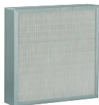
FTR F7 228X224X24 Code 22625