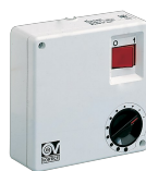
C 1.5 (COMANDO EL. 1.5 A) Code 12966