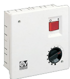
SCNRB SCAT.COM.NON REV.INCASSO Code 12971