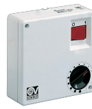
C 1.5 (COMANDO EL. 1.5 A) Code 12966