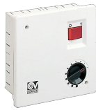
SCNRB SCAT.COM.NON REV.INCASSO Code 12971