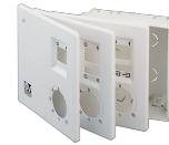
KIT SCB (TRASF.E.C.) Code 22481