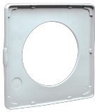
S 150/6 Code 22156