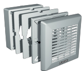
F 150/6" Code 22133