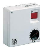
C 1.5 (COMANDO EL. 1.5 A) Code 12966