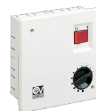
SCNRB SCAT.COM.NON REV.INCASSO Code 12971