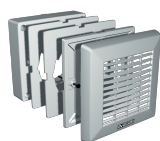
F 150/6" Code 22133