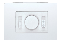
HRW RC Code 22693