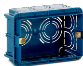
SCATOLA INCASSO TIPO 503 Code 22461