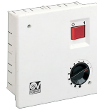
SCNRB SCAT.COM.NON REV.INCASSO Code 12971