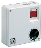
C 1.5 (COMANDO EL. 1.5 A) Code 12966