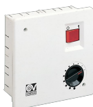
SCNRB SCAT.COM.NON REV.INCASSO Code 12971