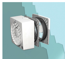
KIT VV 150/6" (DOPPI VETRI)