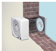
KIT MU (MURO)