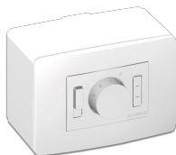
TRIO-CA Code 12869