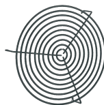
CA-G 125 (GRIGLIA DI PROTEZIONE) Code 22755