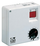
C 1.5 (COMANDO EL. 1.5 A) Code 12966