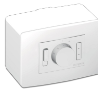
TRIO-CA Code 12869