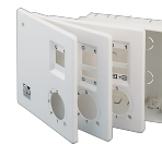
KIT SCB (TRASF.E.C.) Code 22481