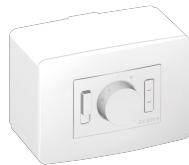
POT-IT Code 12826