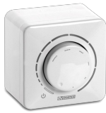
POT Code 12828