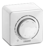
POT Code 12828