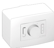
POT-IT Code 12826