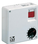
C 1.5 (COMANDO EL. 1.5 A) Code 12966