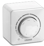
POT Code 12828