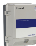
IRET INVERTER 2,5 M Code 12816