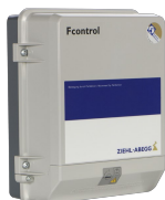
IRET INVERTER 2,5 M Code 12816