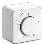
POTI NRG Code 21039