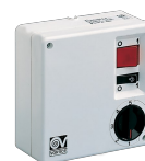
SCNRL5 UNIF. X NK SOFFITTO Code 12957